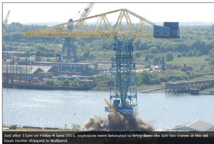
Just after 11am on Friday 4 June 2010, explosives were detonated to bring down the last two cranes at the old Swan Hunter shipyard in Wallsend.

The crane stood tall, towering over the water below. Out of nowhere, a huge explosion of dust like a desert volcano, erupted out of the ground. The dust filled the air as the crane creaked and cracked. Slowly, the crane began to tremble and suddenly the crane began to tumble to the floor. In one huge bang, the crane plummeted to the ground, shooting dust all around, swallowing up the shattered crane whole.