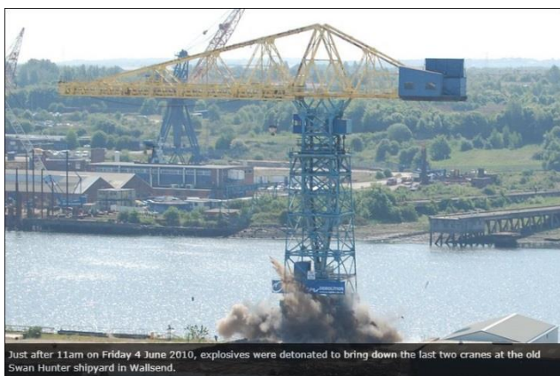
Just after 11am on Friday 4 June 2010, explosives were detonated to bring down the last two cranes at the old Swan Hunter shipyard in Wallsend.

One method would be to give students an image from the We Made Ships site, such as the two below of the Swan Hunter Cranes being demolished, or perhaps of the Jarrow March or a ship being launched.